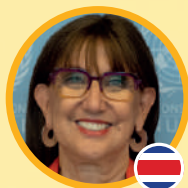
Rebeca Grynspan Secretary-General United Nations Conference on Trade and Development