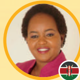
H.E. Anne Waiguru EGH, OGW Governor Kirinyaga County Government