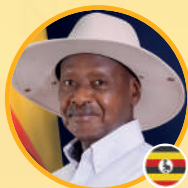
H.E. Yoweri Kaguta Museveni President of the Republic of Uganda