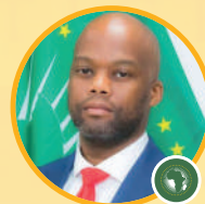
H.E. Wamkele Mene Secretary General - Africa Continental Free Trade Area