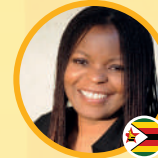
Dr Petina Gappah Principal Legal Advisor Secretariat -The African Continental Free Trade Area