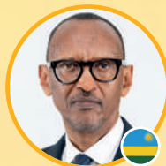
H.E. Paul Kagame President of the Republic of Rwanda