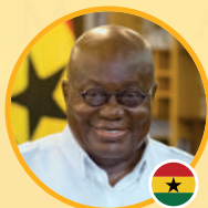
H.E. Nana Akufo-Addo President of the Republic of Ghana